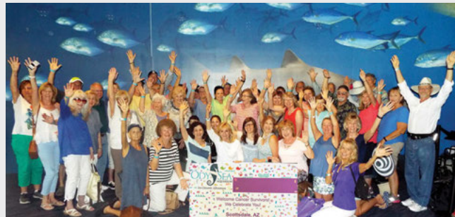
Scottsdale, AZ – Attendees of the National Cancer Survivors Day celebration hosted by the HonorHealth Virginia G. Piper Cancer Center gather at The OdySea Aquarium to show there is life after cancer – and it's something to celebrate!