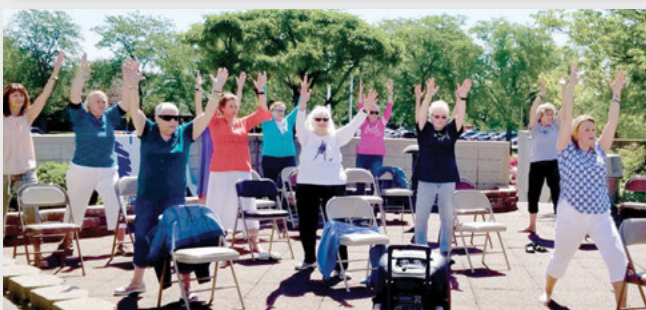
Munster, IN – NCSD participants take part in a chair yoga demonstration during the Cancer Survivors Day breakfast hosted by Cancer Resource Centre and St. Catherine Hospital. The event also included music, testimonials, and a guided imagery presentation.