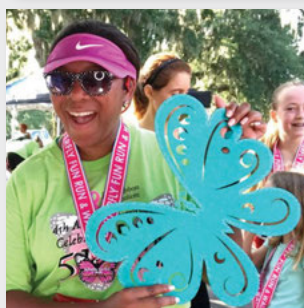
Orange Park, FL – Attendees enjoy a beautiful day celebrating life at the Fourth Annual Pink Ribbon Symposium Survivorship Celebration Butterfly 5K Fun Run and Fun Walk.