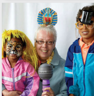
Taneytown, MD – Cancer survivors and their families commemorate National Cancer Survivors Day with fun photos snapped in the photo booth at Carroll Hospital's "Joining Hands in the Fight Against Cancer" event.