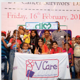
Mumbai, India – Survivors and their caregivers attend a Cancer Survivors Day musical event, with a special celebrity appearance by actress Sakshi Tanwar, hosted by V Care Foundation at Tata Memorial Hospital.