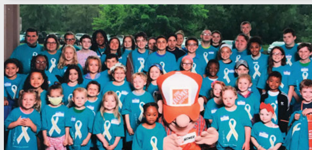
Rochester, NY – Homer, the Home Depot mascot, gathers together childhood cancer survivors from their laughing and playing for a group photo at the annual Survivors Day Picnic at Genesee Valley Park, hosted by CURE Childhood Cancer Association.