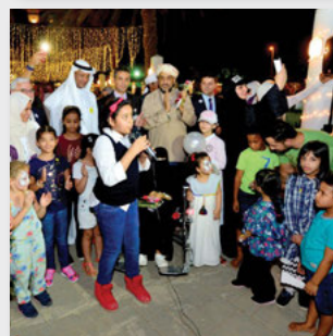
Jeddah, Saudi Arabia – Survivors and supporters gather for a spiritual night in the garden at King Faisal Specialist Hospital and Research Center, Jeddah branch, to celebrate Cancer Survivors Day.