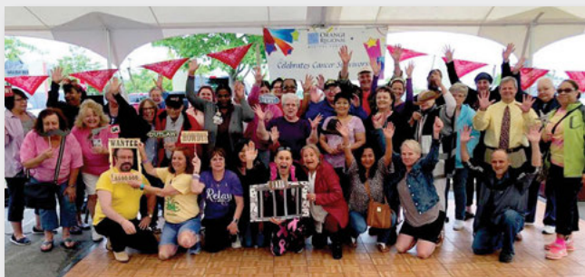
Middletown, NY – Orange Regional Medical Center's cancer survivors give a rousing cheer as they enjoy the hospital's NCSD hoedown, complete with a bluegrass band, square dancing, education, inspiring speeches, and crafts.