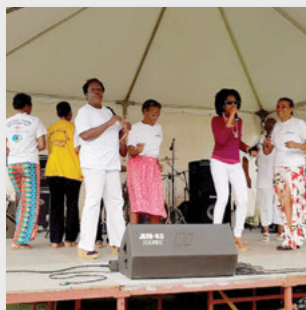
Castries, St. Lucia – A cancer survivor performs an original song as other survivors back her up with celebratory dancing at Faces of Cancer St. Lucia's NCSD event.