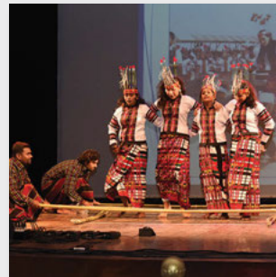
Mumbai, India – Attendees enjoy a traditional bamboo dance from Nagaland at the Cancer Survivors Day celebration hosted by UGAM, a support group for childhood cancer survivors.