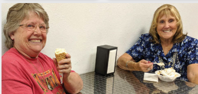
World, WI – Celebrants enjoy ice cream sundaes after a meet and greet with therapy horses Emmy and Coco at the National Cancer Survivors Day celebration hosted by Rainhorse – Horses for the Human Spirit.