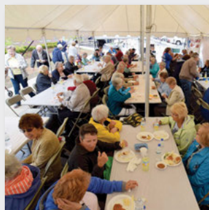
Marinette, WI – A large group gathers for a Cancer Survivor Picnic at Bay Area Medical Center's National Cancer Survivors Day celebration, the first public event in their new facility.