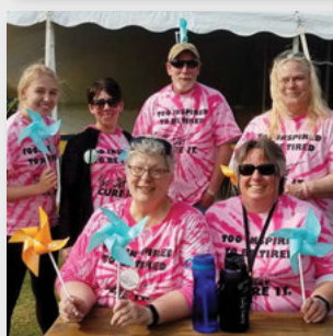
Sheboygan, WI – Team members show off their memorial pinwheels ahead of the Mindful Tri, a holistic walking event, at the Cancer Survivors Picnic hosted by Aurora Health Care and Vince Lombardi Cancer Clinic.