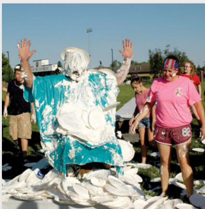
Columbus, OH – A benevolent volunteer holds his hands up in surrender after taking countless pies in the face at the Survivors Day "Speed Pie" fundraising event hosted by the American Pie Party at Walnut Hill United Methodist Church.