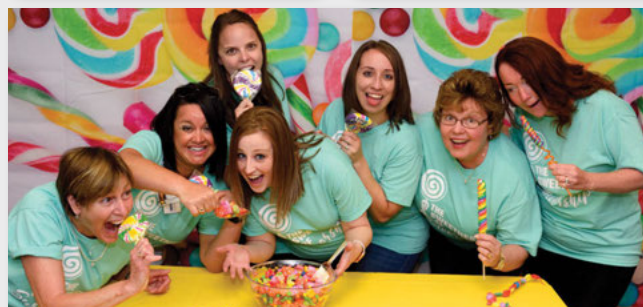
Philadelphia, PA – The Mercy Cancer Center at Nazareth Hospital's NCSD event committee clowns around at the center's candy-themed "Sweetness of Survivorship" National Cancer Survivors Day celebration, where event participants took advantage of the colorful candy photo op and enjoyed the sweet melodies of the Shop Class Quartet. ►