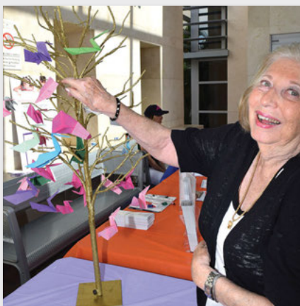
Boca Raton, FL – To help their "Hope Soar," cancer survivors and families adorn origami trees with origami swans bearing handwritten messages at the Boca Raton Regional Hospital National Cancer Survivors Day event.