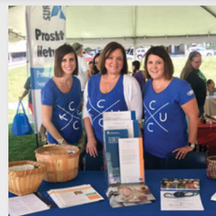
Kansas City, KS – University of Kansas Cancer Center team members take a break from greeting survivors to pose for a photo at the KUCC Cancer Survivor Celebration.