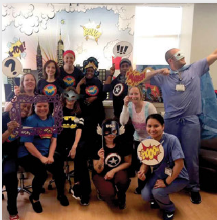
Philadelphia, PA – Infusion nurses show what heroes are made of as they sport their best superhero costumes at the Celebrate Life! event hosted by the Abramson Cancer Center at Pennsylvania Hospital.