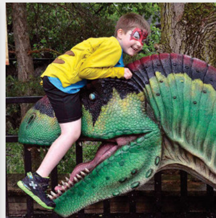
Syracuse, NY – Survivors, supporters, and life-sized animatronic dinosaurs alike invade the Rosamond Gifford Zoo to enjoy NCSD festivities, including dinner and animal demonstrations, hosted by Upstate Cancer Center.