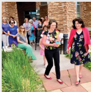
Parker, CO – Cancer survivors, health-care professionals, families, and friends gather outside for a ladybug release at Parker Adventist Hospital's National Cancer Survivors Day event.