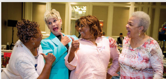
Sugar Land, TX – These boisterous Survivors Day participants share a fun, celebratory moment at Houston Methodist Sugar Land Hospital's globally-inspired luncheon.