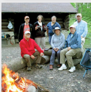
Sheboygan, WI – An enthusiastic group of survivors and supporters takes a fireside break during the Sheboygan County Cancer Care Fund's unique NCSD hike.