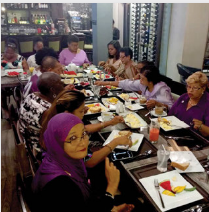
Georgetown, Guyana – Cancer survivors gather at Bistro's Café & Bar to enjoy a National Cancer Survivors Day celebration brunch hosted by the Guyana Cancer Foundation of Guyana, South America.